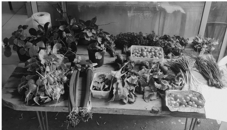
Fresh vegies available at the shed