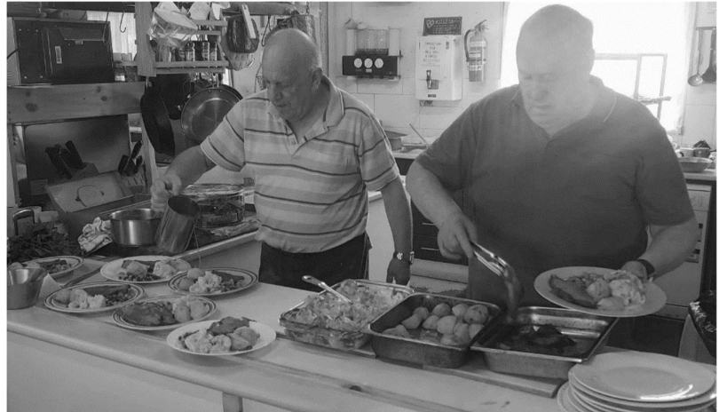
Serving up an amazing Wednesday members lunch

As the summer heat visits us on the occasional day over the past weeks, the Men's Shed has been nice and cool thanks to the air-conditioning installed last year. This was made possible with the help of our local Kooweerup Community Bank and funds raised by the Men's Shed members. Wednesday lunches continue to be well attended and we continue to welcome new members. With free internet access on our computers, the lounge area to relax, games to play and people to chat too, the Men's Shed is a great place to be. A few of the guys have been doing woodwork projects and now that school is back, we will soon see students on the tools. We're again seeing sparks fly in the metal work area as members start building the Time Capsule for the Hospital 100 year celebration.